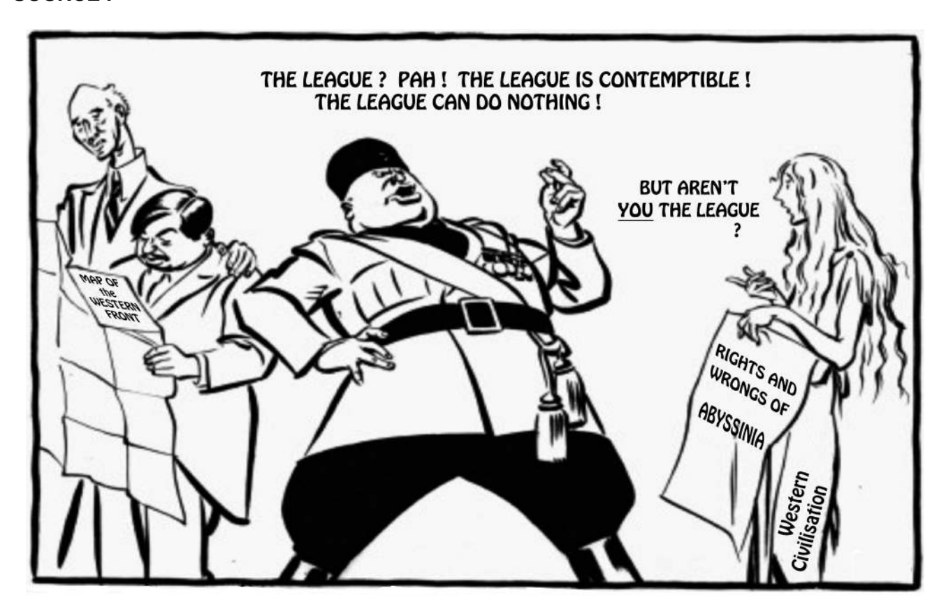
A British cartoon published in February 1935.