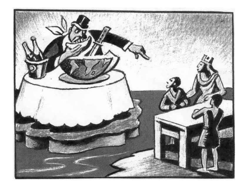
An Italian cartoon showing Britain (top left) criticising Italy (bottom right) over Abyssinia. This cartoon was published in October 1935 in a newspaper founded by Mussolini.