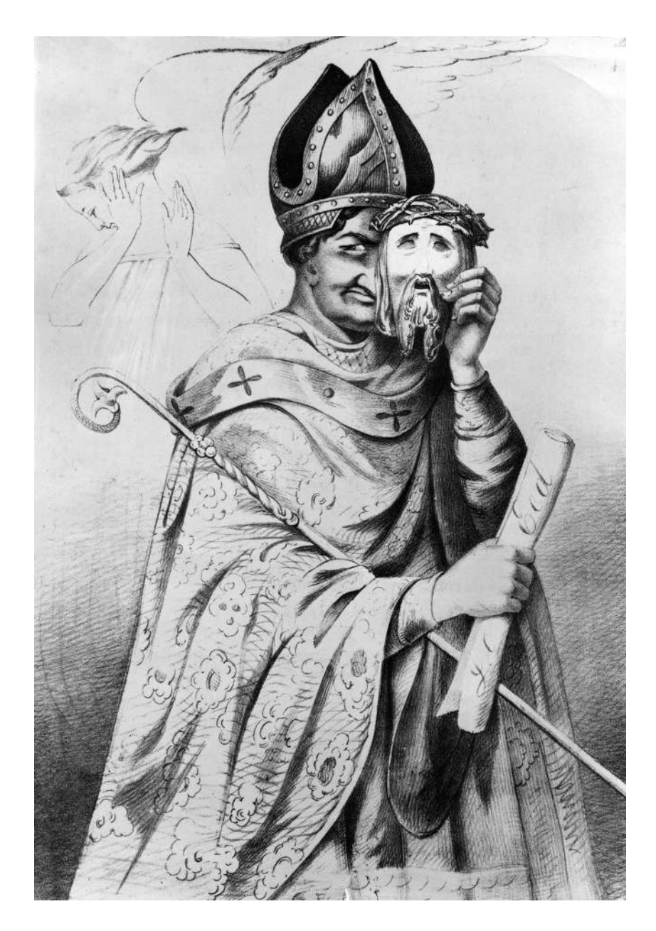
A cartoon of Pope Pius IX published in 1852. He is holding a mask of Christ.